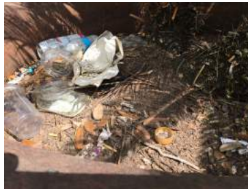
• trash in decorative urns