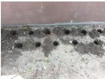
• missing plantings

Call went out via NEXTDOOR for persons interested in “adopting” Gayarre Place Park. The hugely historic and important pocket park has litter issues and landscaping problems. Parkway has been contacted to develop a source of water for plants. The Monumental Task Committee has done graffiti removal and preservation on the statue there.